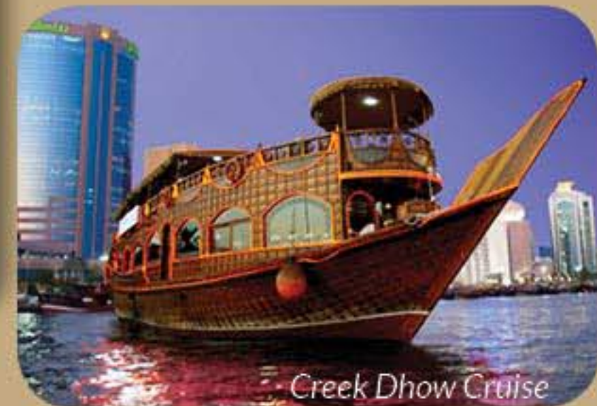
Creek Dhow Cruise